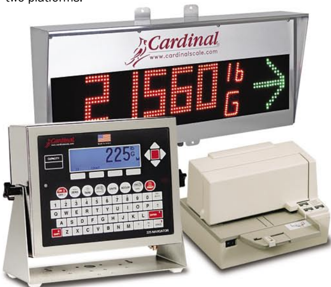
Weight indicators, remote displays, and printers are all available from Cardinal Scale to complete your railcar weighing operation.

Cardinal Scale's USA-made LPRA series railroad scales feature a rugged weighbridge with electronic or hydraulic load cell mounting assemblies. The low-profile design eliminates the expense and maintenance of a deep pit. Removing the need for excavation of a deep pit and additional concrete work means construction costs are lower and installation time is shorter. Cardinal's LPRA series can weigh a wide range of rail car sizes. Twenty-five foot approaches are required on each end of the scale, along with an intermediate section in between the two platforms.