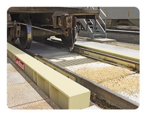
Grain Dump Grating Optimizes Unloading

Guardian hydraulic load cells are impervious against lightning strikes and water damage.