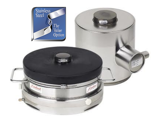
USA-Made Electronic or Hydraulic Load Cells

Guardian hydraulic load cells are impervious against lightning strikes and water damage.