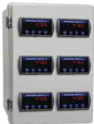
Local displays provide data access at ground level.

BinMaster offers several display modules to provide access to level data locally at the bin. This allows workers and drivers quick access to inventory levels from the ground or a vehicle. There is no need to visit a control room or the office. BinMaster will design a solution that fits your needs and budget based upon the number and location of your silos and where it is easiest to access data.