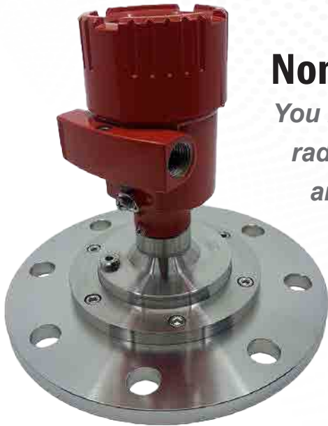
NCR-86 with swivel flange