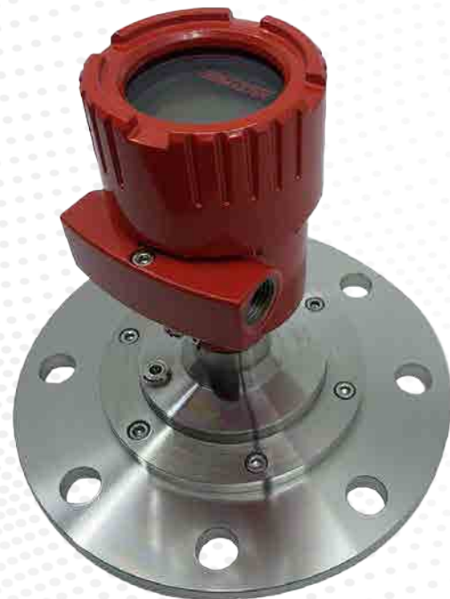
Stainless Steel Flange

There are three versions of the NCR-86 including a metal-jacketed lens antenna, a plastic horn antenna, and a threaded model. There are countless configurations of the NCR-86 offering a diverse selection of approvals, mounting options, specialized seals, output options, and housings. Inventory can be viewed on BinCloud®, Binventory® LAN-based software, or PLC plus an assortment of digital panel meters and display consoles.