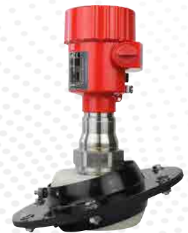
NCR-86 with mounting plate

You have many choices when it comes to a non-contact radar. What you might NOT get from other manufacturers are the options and accessories that make your installation simpler and more affordable. Plus, BinMaster supplies the complete solution from the sensor to the software and everything in between.