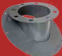
30° Mounting Plate