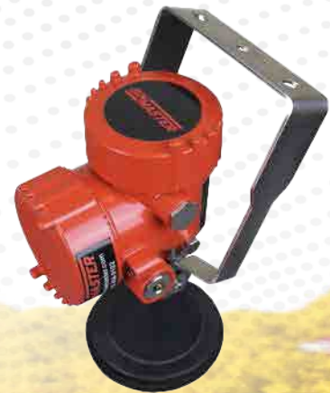
NCR-86 plastic horn model with mounting strap

For aiming flexibility, a 10° swiveling holder for the metal jacketed version of the NCR-80 comes in 4", 6", or 8" flange sizes to allow for precise aiming to the output of the vessel. For the NCR-80 plastic horn antenna version, 8° directional aiming is available with 2", 2.5", 3", 4", 5", 6", or 8" adapter flanges.