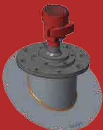
30° Mounting Plate with NCR-86 metal jacketed model

Not all roofs are flat throughout the process industries. Therefore, in addition to the affordable 0° mounting plate BinMaster offers 10°, 30°, and 45° mounting plates with a 4" ANSI flange.