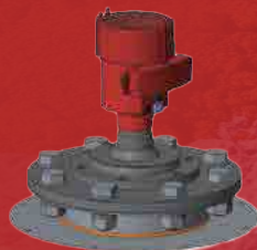
0° Mounting Plate with NCR-86 metal jacketed model