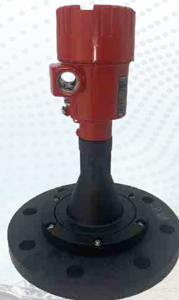
Plastic Horn Antenna