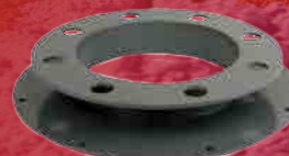
0° Mounting Plate