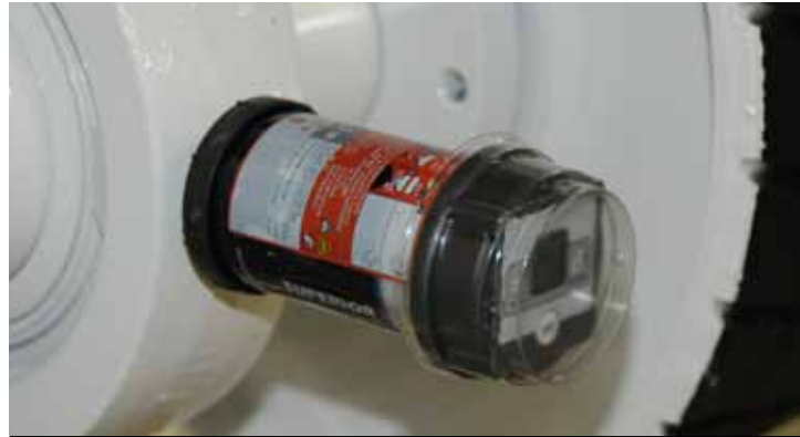
Superior Auto Greaser