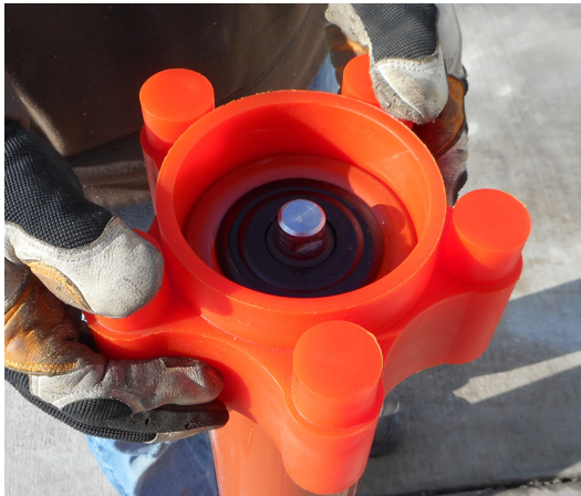
EASILY SLIDE DISC ONTO RETURN ROLLER