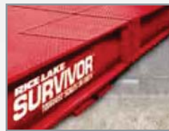
SURVIVOR ® OTR Top access, low profile concrete or steel deck