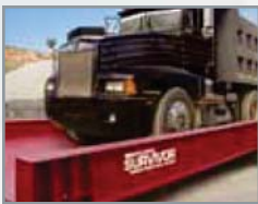
SURVIVOR ® SR Extreme-duty, low profile concrete or steel deck siderail scales