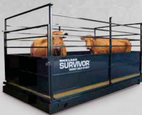
SURVIVOR LS Series pictured here with custom racks and gates.

In a market crowded with scales manufactured to compete on price alone, Rice Lake's livestock scales are built from the ground up for lasting performance under the most severe conditions. Whether you choose the RoughDeck ® SLV single animal scale or the SURVIVOR ® AG, LV or LS, you're getting the Toughest Scale on Earth. ®