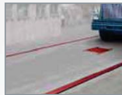
SURVIVOR ® PT Pit-type concrete or steel deck scales