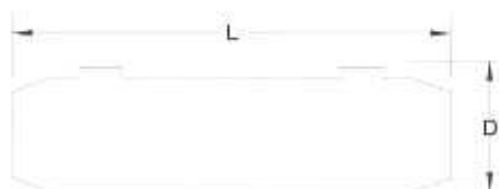
72-N1, 72-N2, 72-N3